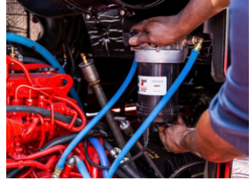
Easy Access to Fuel / Water Separator