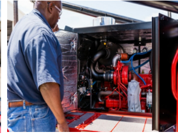
Service & Inspection from Ground Level