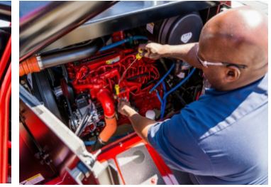
Easily Accessible Daily Checks