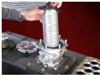
Spin-on Breather, Wire Mesh Strainer & Replaceable Internal Element (Standard)