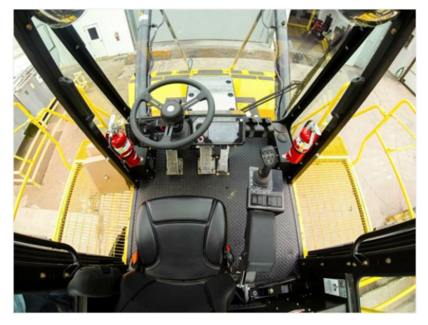
Fully Enclosed 2-door Cab - All Steel - 32,000 BTU Heater (Standard)