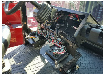
Flip-down Dash with Color/Number Coded Wiring (Standard)

Taylor Empty Container Handlers are designed with ease of maintenance and serviceability as a key priority. With today's engine and emissions requirements, daily maintenance checks and timely periodic service are the key to your equipment's longevity. All daily checks across the Taylor product line can be accessed from either the ground or running board, ensuring that operators can complete these requirements with ease. Also, the side service doors and removable deck panels open to expose the drivetrain and hydraulics to provide easy access for service and inspection.